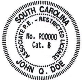
Associate Professional Engineer (Category B—Restricted License)