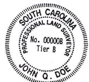
Professional Land Surveyor—Tier B